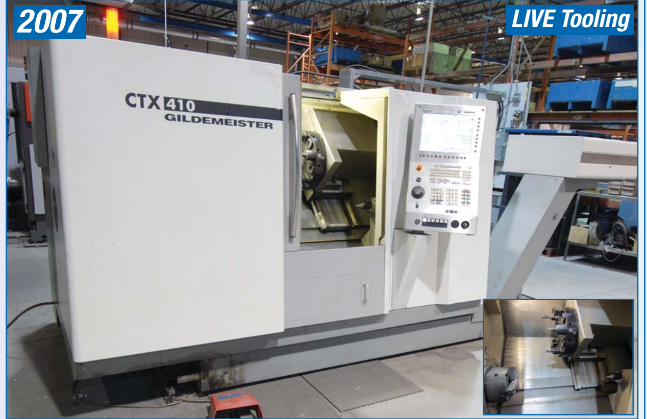
DMG GILDEMEISTER CTX410 CNC LATHE