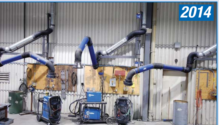
CPI SNORKEL EXHAUST SYSTEM