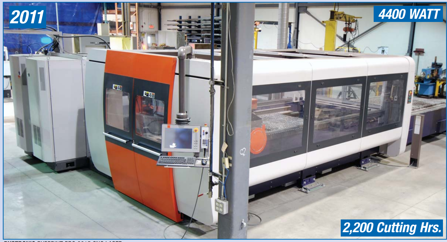
BYSTRONIC BYSPRINT PRO 3015 CNC LASER