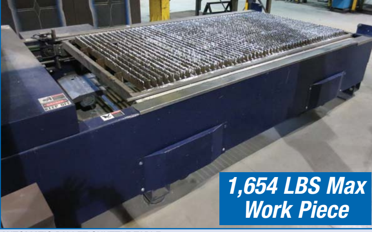
AUTOMATIC PALLET SHUTTLE TABLE