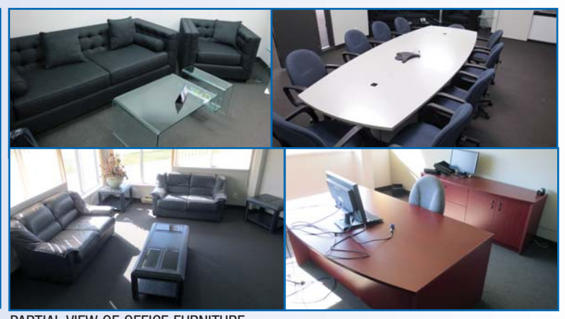
PARTIAL VIEW OF OFFICE FURNITURE