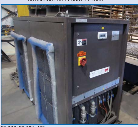
EF COOLER WKL 430

2011 BYSTRONIC BYSPRINT PRO 3015, 4400 WATT CNC Laser with ByVison CNC control, travels: X-120", Y-60", Z-2.75", positioning accuracy +/- .004", max work piece weight 1,654 lbs., max. positioning speed - parallel axis X,Y: 328 ft./min., max positioning speed - simultaneous axis X,Y: 460 ft./min., approx. weight 28,660 lbs., BYSTRONIC BYLASER 4400 WATT power source with 6,100/2,200 hrs., 7.5" & 5" cutting heads, automatic pallet shuttle table, EF COOLER WKL 430, s/n R1119369