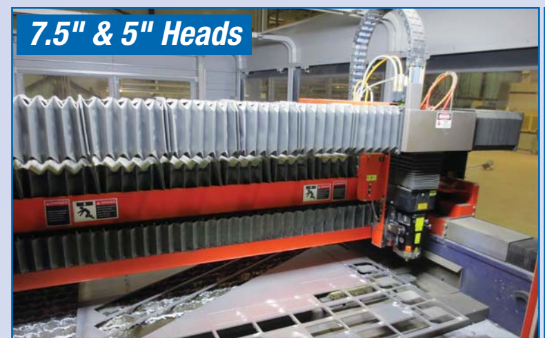
VIEW OF COLUMN AND CUTTING HEAD