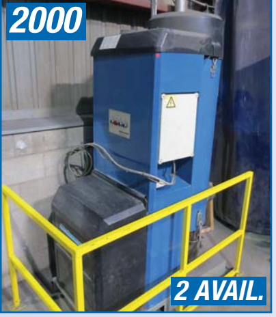
NEDERMAN E-PAK 300 EXHAUST