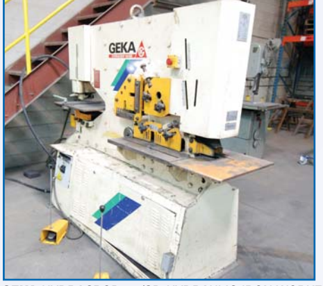
GEKA HYDRACROP 80/SD HYDRAULIC IRON WORKER HYSTER H80XL2 LPG FORKLIFT