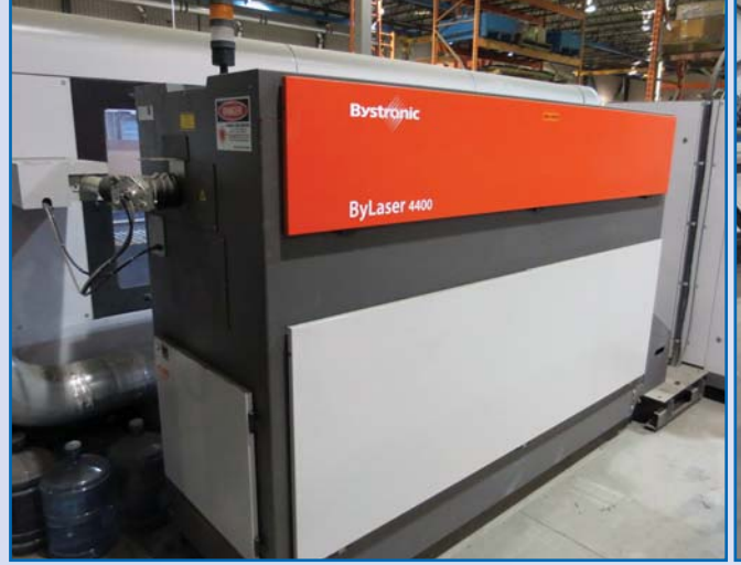
4400 WATT POWER SOURCE