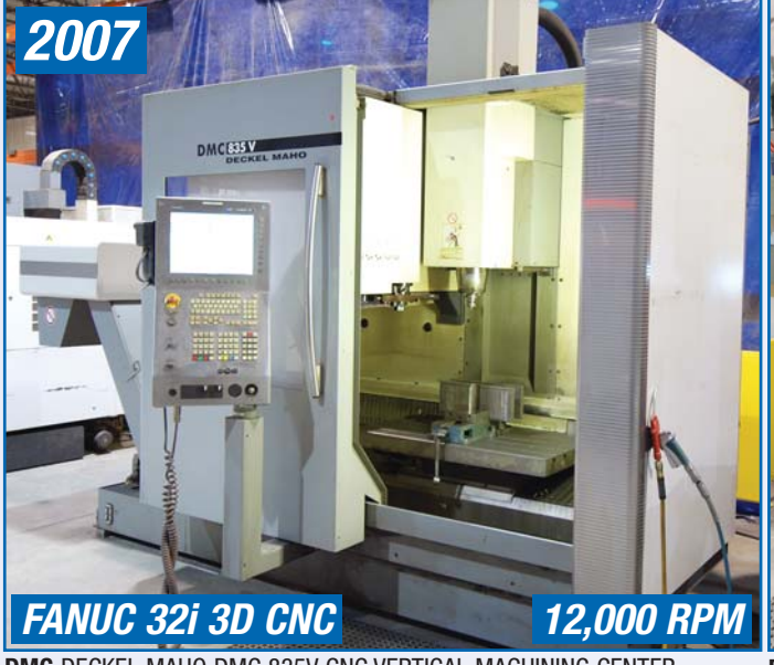
DECKEL MAHO DMC 835V CNC VERTICAL MACHINING CENTER