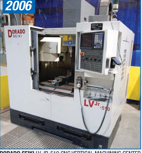
DORADO SEIKI LV JR-510 CNC VERTICAL MACHINING CENTER